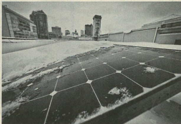
Since the Hall of Laureates was pursuing a National Register of Historic Places designation, the 90 solar panels on top of the building couldn't stick up.

East. Since reduced energy costs, including transportation of materials, is one of the LEED designation requirements, a source of identical sand-