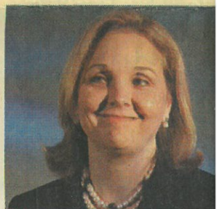
JOSETTE SHEERAN: "There must be something in the water in Iowa. Iowa should be very proud that it is ground zero in the fight against hunger."